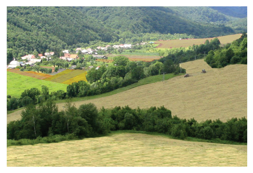
Fig. 3. Scenario 1: Business as usual.

Restoration of agricultural land management can stop or reduce succession processes in parts of agricultural landscape, abandoned in the past. Start of extensive management of formerly abandoned grasslands will create better condition for grassland species and in such way can contribute to the biodiversity maintenance in the study area. Although, agriculture tends to be focused on management of grasslands in the basins, nearby villages, therefore persistence of "poloniny" – mountain meadows might not be secured.