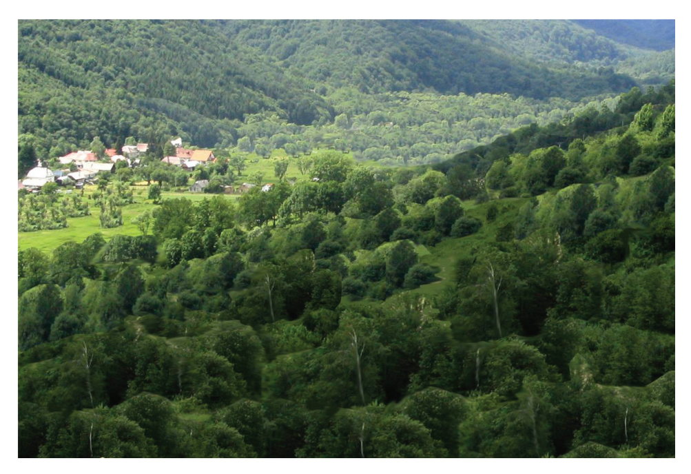
Fig. 4. Scenario 2: Agricultural liberalisation.

Significant restriction of farming means end of crop production, mowing (except areas of nature protection), grazing, milk production, livestock breeding, etc. Agricultural machinery is sold off to prosperous farms or various companies outside the region or arranged for using in the forestry. Farming activities stay only in the form of tiny individual parcels and fields near villages, however in decreasing number. Forestry and nature protection stay in the region, other activities hardly survive due to continuous depopulation and abandonment of the territory. Abandonment causes overgrowing of the most of agricultural land, gradual increase of shrubs and trees, forest expansion, the loss of the land-scape structure and scenery of the narrow, small fields and meadows, forming mosaics in vicinity of villages, together with loss of habitat of plants and animals of these habitats (Fig. 4).