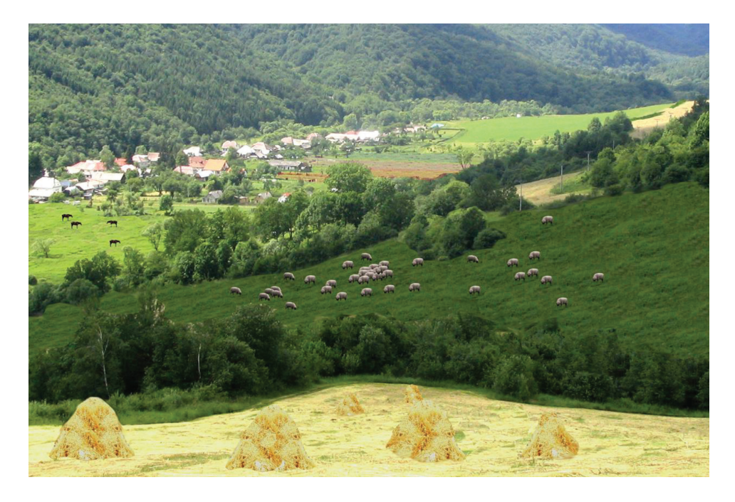
Fig. 5. Scenario 3: Managed change for biodiversity.

There are not expected as many changes in the landscape structure as in the second scenario (Fig. 5), because some grasslands must be kept in good state due to priority of biodiversity (Ministry of Environment of the SR (1997), National park Poloniny Administration (2000)). Surely, some agricultural localities stay without management, due to limits of nature conservation possibilities, mostly valuable grasslands are maintained (Halada, Ružičková, David, 2004). Nature protection is aimed also at the maintenance of the specific landscape structure of the territory – small fields and meadows, forming mosaics in vicinity of villages. Some of currently maintained private parcels around villages will be overgrown due to decrease of number of inhabitants, but there is increase of the utilisation of the plots for agro-tourism. Forest cover is slightly expanding, at the expense of some grasslands (especially those with-