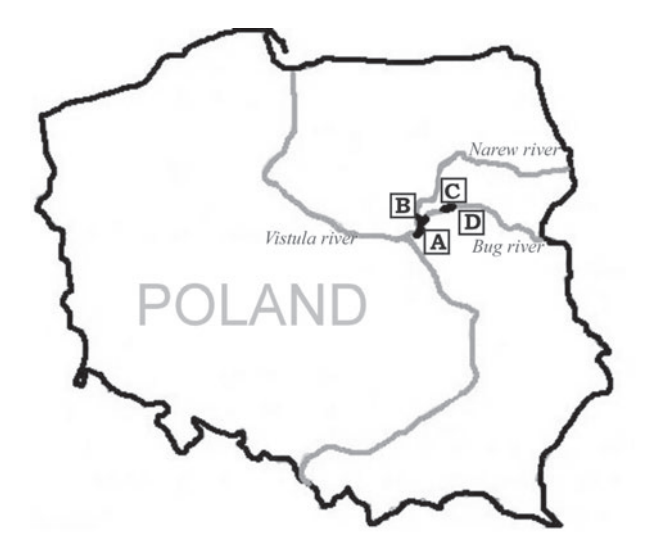
Fig. 1. Map of study area: Zegrzyński reservoir(A), outlet river stretches (B), through-flow oxbow lakes (C), oxbow lake isolated from the river (D).