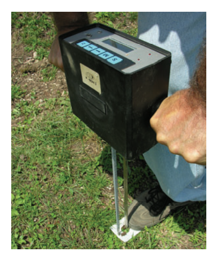
Fig. 1. Measurement of soil depression by penetrometer P-BDH 3A.

The pasturelands had been used by Charolais beef cattle, and surface phytomass samples were taken at the end of October and at the beginning of November before snowing and three repetitions were subjected to 60 °C drying. These were then sent in 200 g homogenized form for laboratory chemical analysis to JLU Giessen in Germany. The ergosterol concentration was determined after extraction by High Performance Liquid Chromatography at UV detector according to Schwadorf, Müller (1989). The ash level in g.kg<sup>-1</sup> of solids, NEL and ME in MJ.kg<sup>-1</sup> of solids and also the digestibility of organic matter (DOM) in % was evaluated by Steigass, Menke (1986) by the Hohenheim Gas Test, which is an in vitro fermentation method with rumen liquor. This takes the gaseous formation, the crude protein and crude fat content into consideration. The results were statistically evaluated with Statistica software by dispersion analysis and by contrast testing of the analyzed indicators (correlation matrix) by Tukey HSD test (Table 6).