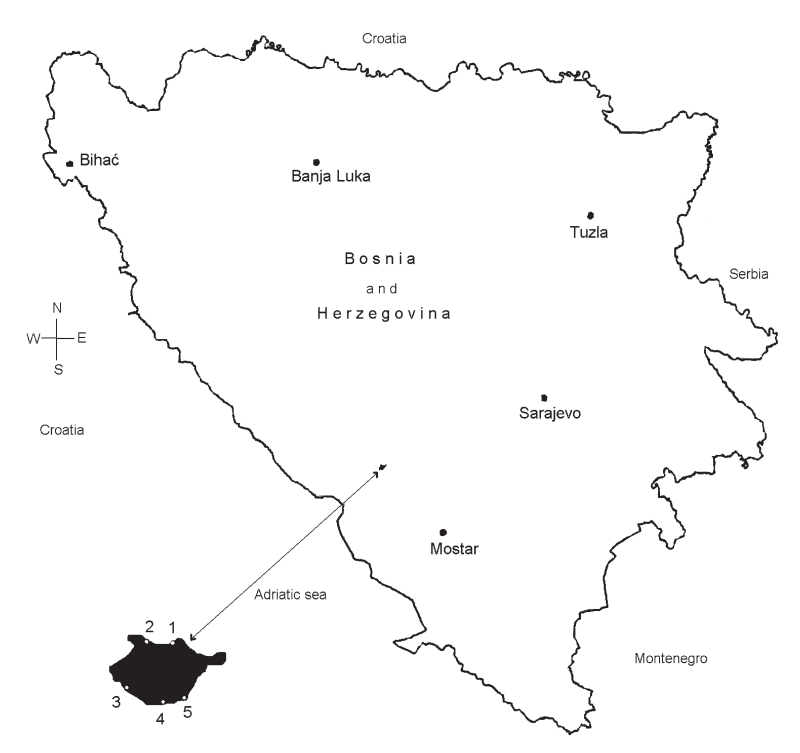
Fig. 2. Marked sampling locations on Blidinje map with marked Blidinje lake position on the map of Bosnia and Herzegovina.

Water sampling for physical and-chemical analysis was carried out using standard methodology (APHA, 1998). Portable (HACH DR/2010) spectrophotometer was applied for all analyses except for the phosphates and total phosphorous which were determined using UV-VIS spectrophotometer (Shimatzu) at 690 nm wavelength.