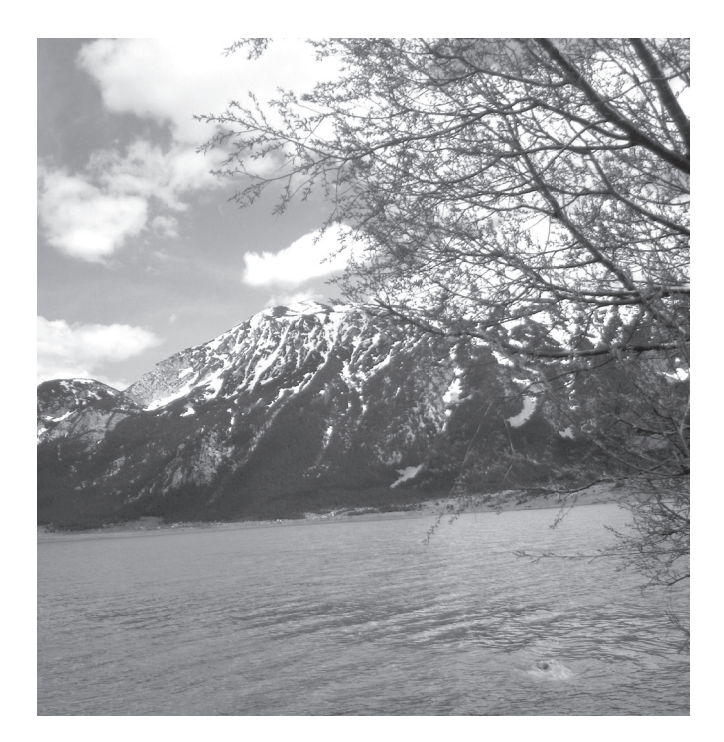
Fig. 1. Blidinje lake.

The lake is very shallow with an average water depth of 0.3 to 1.9 m. The ratio of the surface of the lake during high-water to the surface of the lake during low-water level is 3.6 km<sup>2</sup>: 2.5 km<sup>2</sup> (Spahić, 2001).