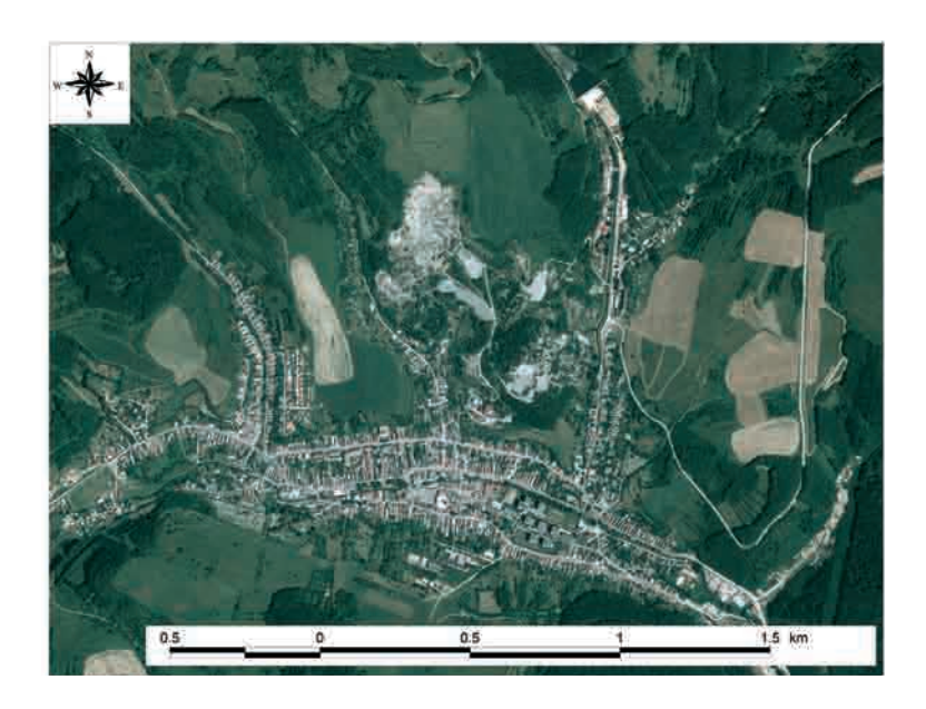
Fig.~11.\ Landscape\ archetype\ with\ mining\ activity\ near\ Dobšin\'a\ in\ the\ conditions\ of\ widened\ part\ of\ valley,\ upland\ relief\ of\ the\ Slovensk\'e\ Rudohorie\ Mts.