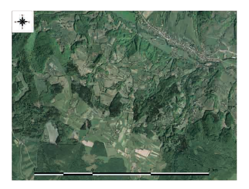
Fig. 19. Horné Hámre village is typical representative of villages with dispersed settlement (part of Nová Baňa dispersed area).