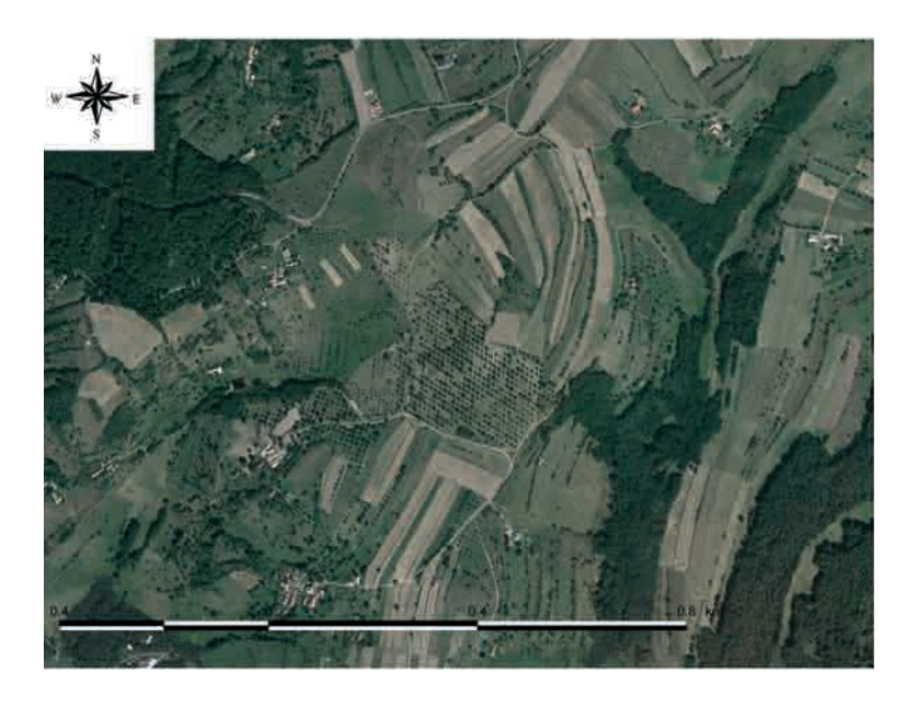
Fig. 14. Varied mosaic of landscape archetype with orchards near Krupina (Krupinská planina Mts).