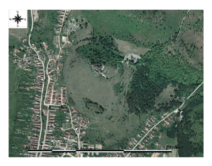
Fig. 17. Eccentric and dominant location of Krásna Hôrka castle in the rural area of Krásna Hôrka village.