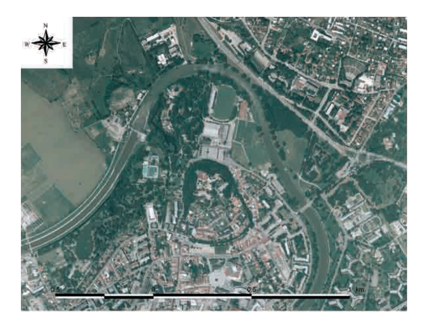
Fig. 18. Distinctive meanders of the Nitra river are the elements of historical core of Nitra town integrated into one unit with dominant element of relatively isolated castle hill.