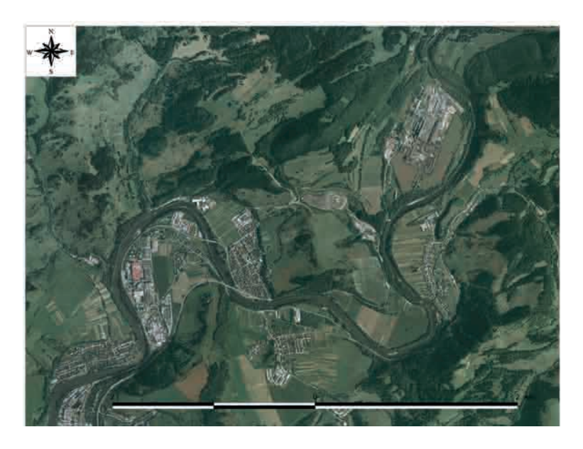
Fig. 3. Distinctively limited structure of settlements in the cognitions of sinuous river Orava in the Oravská vrchovina Mts – Medzibrodie nad Oravou (village).