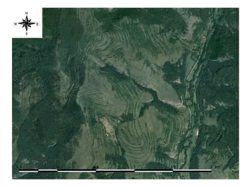
Fig. 10. Contour oriented models of agricultural landscape vegetation in the conditions of inner-mountain erosive furrow of the Slovenské Rudohorie Mts near Nedelište village.