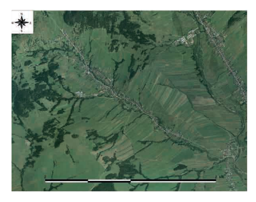
Fig.\ 4.\ Agricultural\ landscape\ archetypes\ with\ characteristic\ striped\ model\ of\ fields\ oriented\ in\ the\ fall\ line\ direction\ in\ Podbeskydsk\'{a}\ br\'{a}zda\ (furrow)\ -\ village\ Siheln\'{e}.