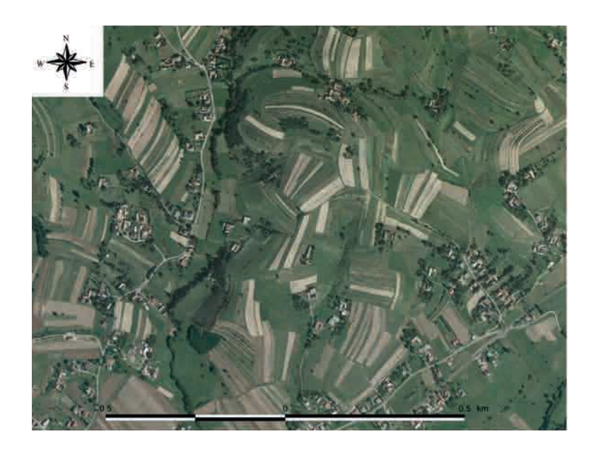
Fig. 9. Mosaic of agricultural landscape models with dispersed type of settlements under the Polana Mts, near Hriňová village.