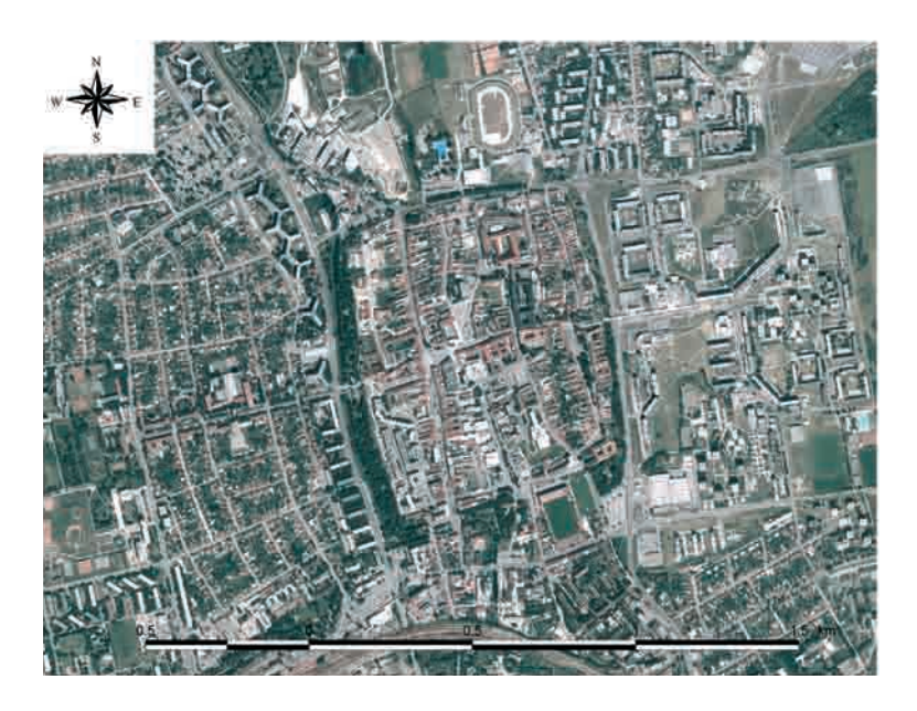
Fig. 15. Historical quadrilateral shape of the core of urban settlement with distinctive fortification limit determined further forming of residential structure of Trnava town.