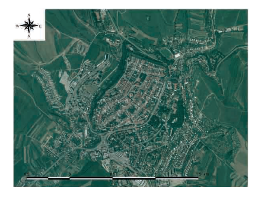
Fig.\ 16.\ Dominant\ core\ of\ Levo\ \check{c}a\ town\ with\ significant\ fortification\ limit\ disabled\ continual\ flow\ of\ newer\ parts of the settlement.