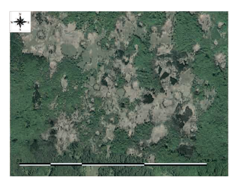
Fig. 6. Round patterns of vegetation in the abandoned pasture lands, conditioned by the karst holes in the area of karst plains of the Slovenský kras Mts.