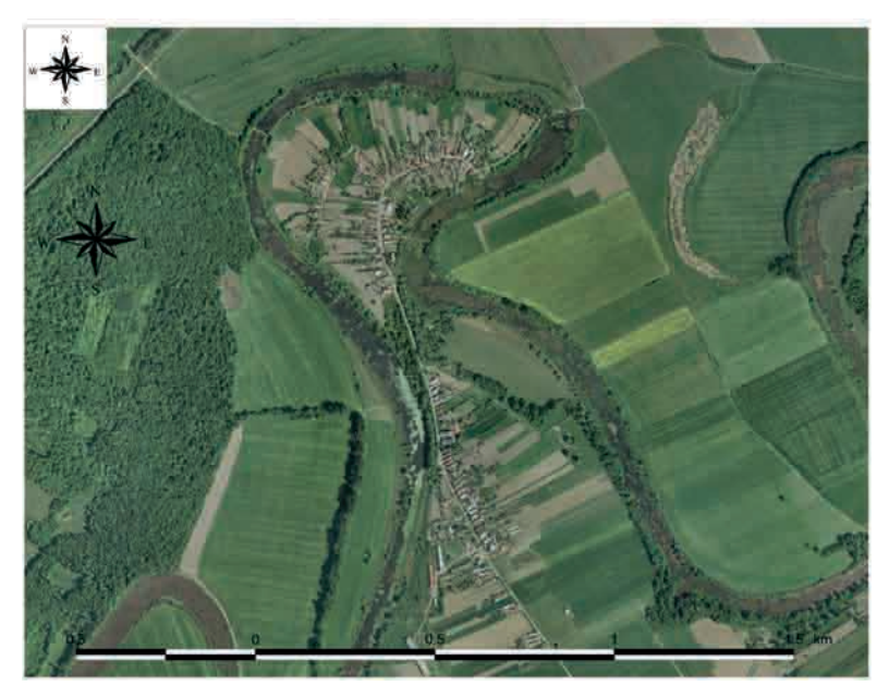
Fig. 1. The example of fluvial landscape with distinctive impact of water course modelling on the landscape structure of village settlement – village Rad in the Východoslovenská nížina lowland.