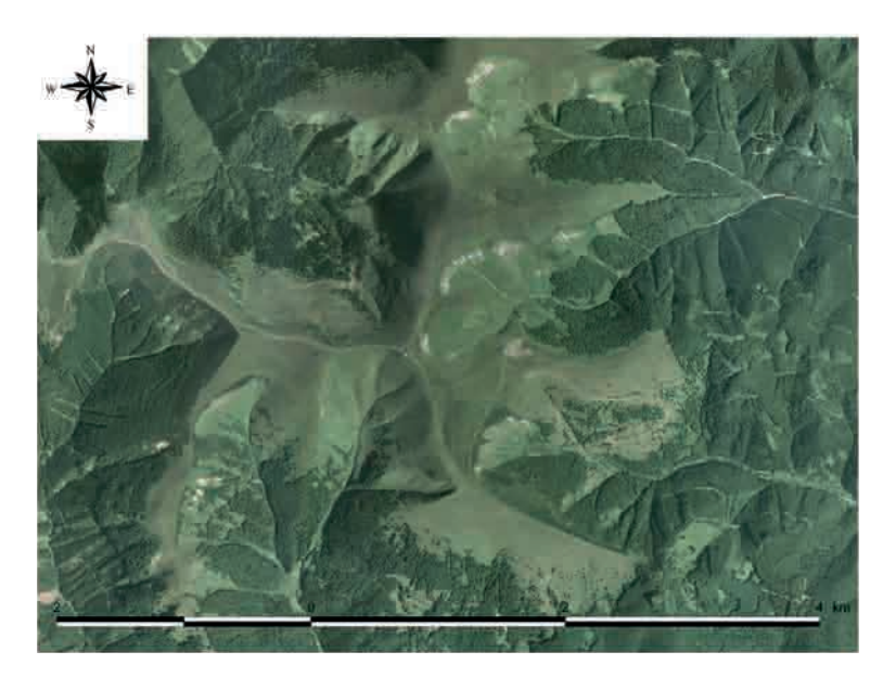
Fig. 8. Grassy upland landscape archetype with mosaic of dwarf pine vegetation and destructive plates in the tear zones of avalanche channel in the area of Krížna in the Veľká Fatra Mts destroyed by the pasturage.

Traditional agrarian ("plough land – meadow – grazing") landscape archetype Increasing number of inhabitants in the Middle Ages was closely connected with the more frequent landscape utilization in the worse natural conditions. Agriculture used to use inclined and paedological areas worse in the comparison with river flood-plain areas. Settlements influencing the landscape look started to be established in these areas. Landscape agricultural activity had different forms depending on relief shapes and inclinations. There