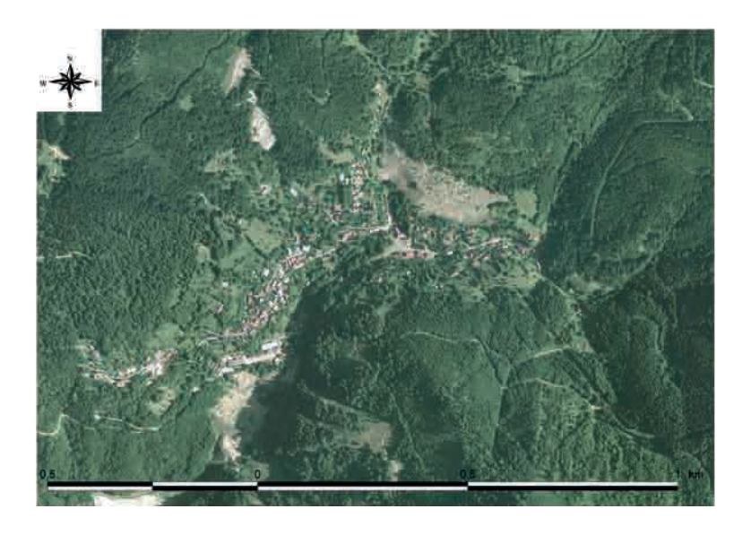
Fig. 12. Landscape archetype with mining activity in the Nízke Tatry Mts – village Špania Dolina.