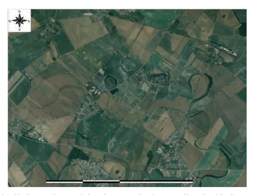
Fig. 2. Fluvial landscape archetype with the wide area agricultural activity and buried models of river meanders reflects processes of intensification and further distinctive changes of the aborigine country – village Trnávka in the Podunajská nížina lowland.